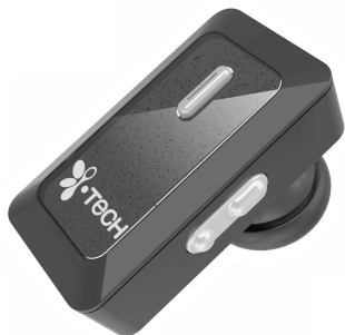
i.Cube Bluetooth Headset